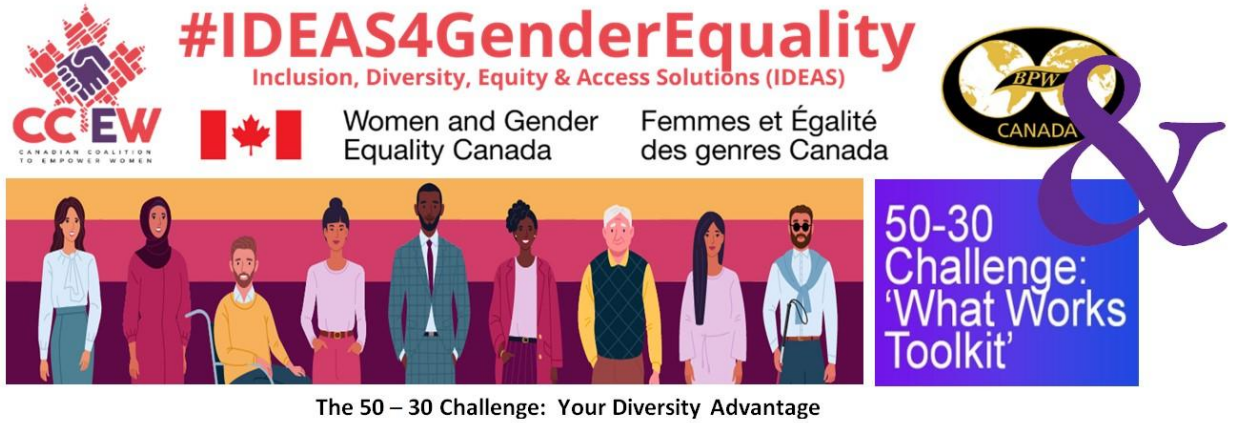
The 50 – 30 Challenge: Your Diversity Advantage

This resource was developed in collaboration with the IDEAS4GE Team, 50 – 30 Challenge Ecosystem Partners/Supporters, and KPMG Canada 50 – 30 Support Team.